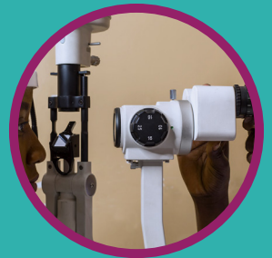
Eye Clinic / Theatre