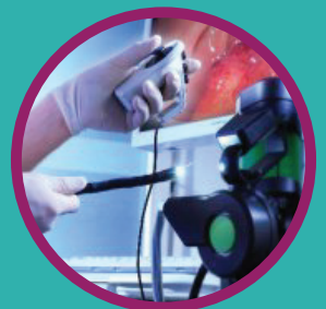
Endoscopy Upper & Lower GI