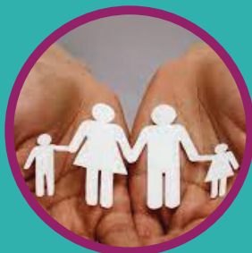
Natural Family Planning